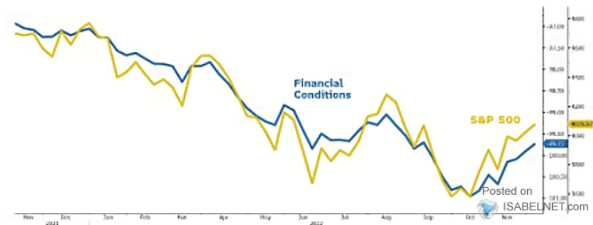
Exhibit 2: ...Coinciding with Higher Stock Prices

The risk at next week's meeting is a Fed determined to fight inflation via tighter financial conditions. Such includes using hawkish rhetoric to talk stock prices lower. Further, they likely want to erase a pivot out of investors' forecasts for 2023. Will the markets price in the Fed's desire for tighter financial conditions? Or will they look past Powell's bluster and continue to dream of a mid-year pivot?