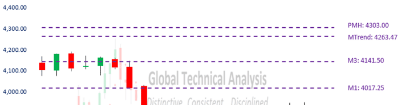
ESU2: June 2022