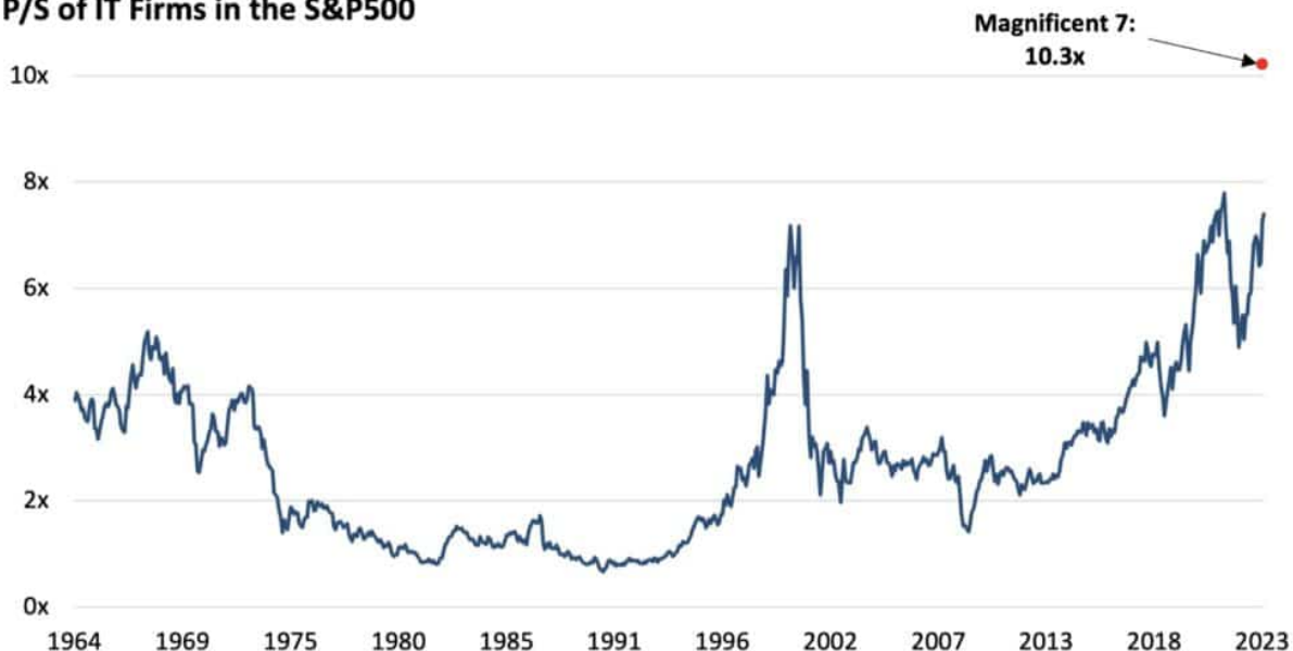
P/S of IT Firms in the S&P500

Source: Kailash Capital Research, LLC; Data from 4/30/1964 - 12/31/2023