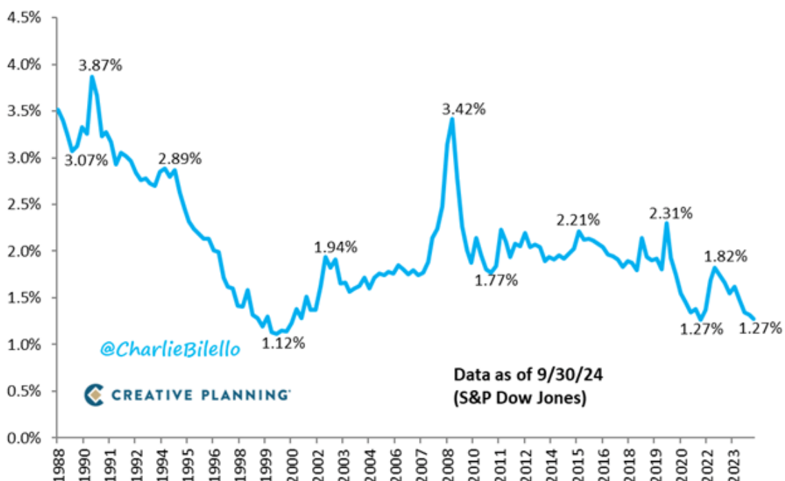
S&P 500 Dividend Yield (TTM Dividends, Q4 1988 - Q3 2024)

Neither graph portends an immediate re-valuation of stock prices, but they should alert investors to a possible drawdown to normalize valuations.