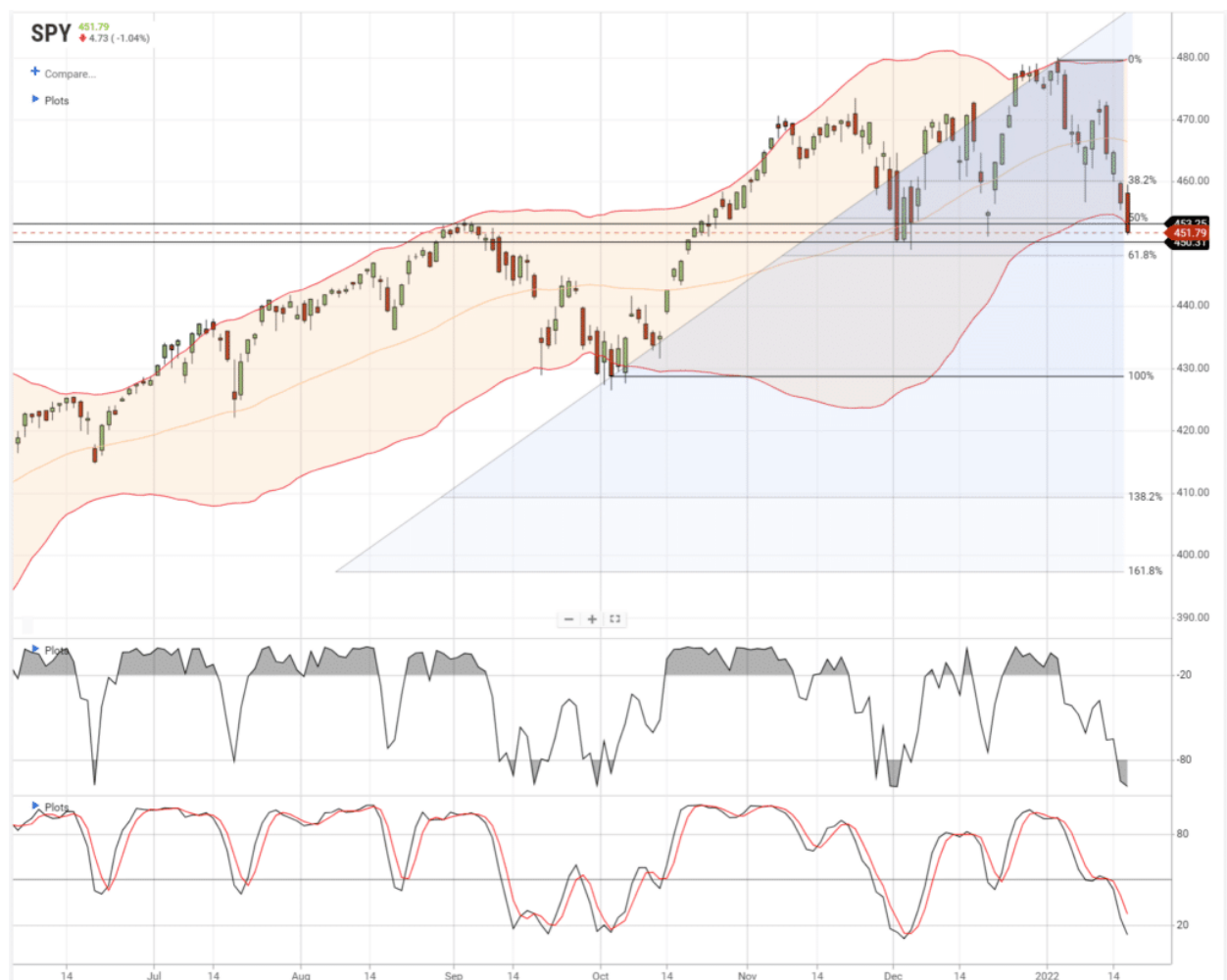
Chart Courtesy of SimpleVisor.com

While the market selloff has been fairly brutal, it has not violated support at the December lows, nor the uptrend. Therefore, be careful making emotionally driven changes to portfolios. Look for a counter-trend rally back to the 50-dma to start rebalancing risk and raising cash levels.